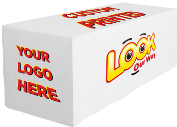
Table size: 182.88cmL x 76.20cmW x 73.66cmH (72"Lx30"Wx29"H) <br/>Table cover size: 330.20cmW x 223.52cmH (130"W x 88"H)

Create a custom tradeshow display with our promotional 4-Sided Fitted Table Cloth! Made of machine-washable polyester fabric, that can be reused over and over again. Using our 4-sided table cloths will make your customers see your brand from all four sides. Complete with full surface, vibrant sublimation branding, to help you stand out with your custom design. It's ideal for promo events and tradeshow to add an extra visual element to your display.?